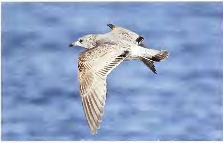
Plate 9. Mew Gull Canus canus , Laoag River, Ilocos Norte, Luzon, 30 December 2013.